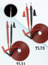
Fluke 15B MAX Kit Digital Multimeter with TL75 + TL31